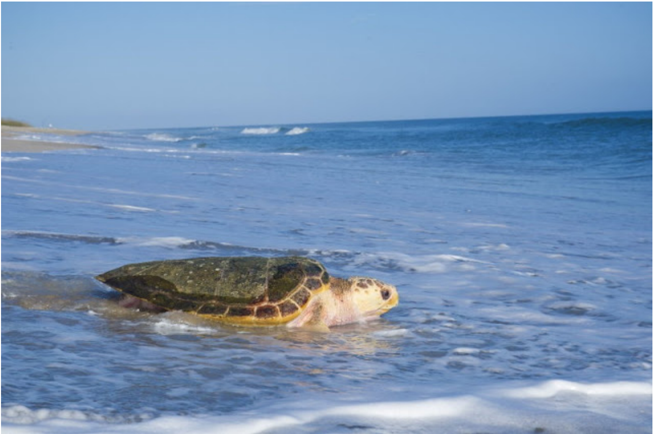
Loggerhead sea turtle

BREVARD COUNTY, Florida - On Wednesday morning, the SeaWorld Orlando Animal Rescue Team returned a 63-pound endangered loggerhead sea turtle measuring 23 inches long to its natural environment on Playalinda Beach at Canaveral National Seashore located off the east coast of Central Florida. The large loggerhead spent more than 3-months at SeaWorld Orlando's rehabilitation facility after a large fishing hook became embedded in its head.