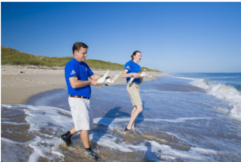
Kemp’s ridley sea turtles

So far in 2015, SeaWorld Orlando has rescued 63 sea turtles and returned 88.