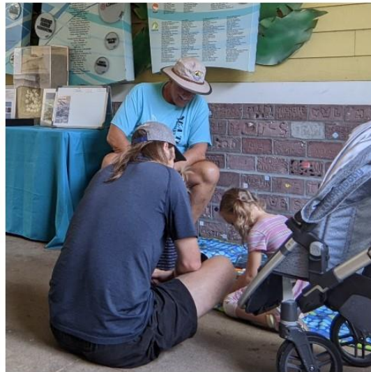
STPS volunteers teaching the public about sea turtles at the Brevard Zoo.